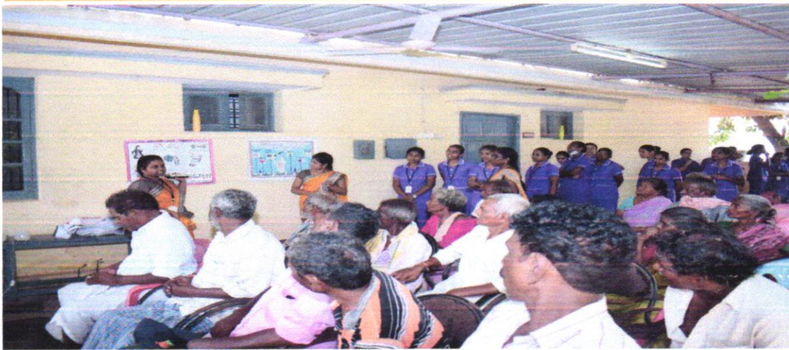
students are giving Health education by showing chart