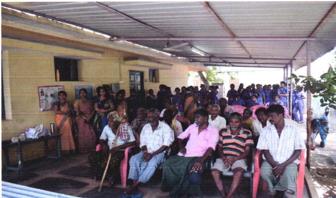
Public gathered on the occasion of world no tobacco day