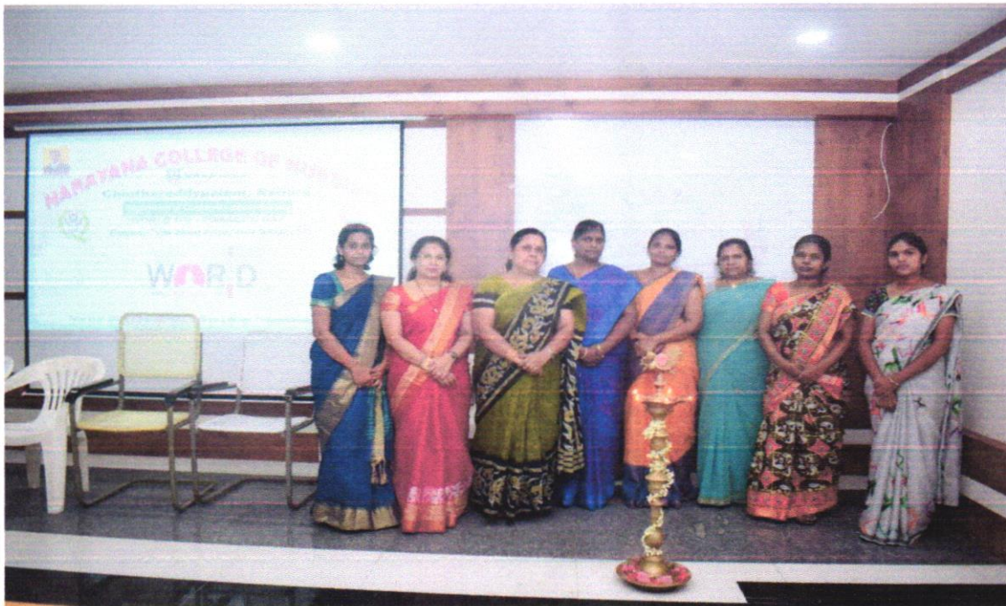
Lamp lighting by dignitaries in prize distribution ceremony on the occasion of world no tobacco day

B. Anj Principal NARAYANA COLLEGE OF NURSING Chinthareddypalem, NELLORE - 524 003