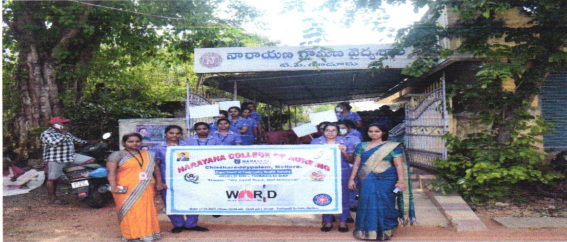
The NSS student volunteers and program officers started the rally from health center