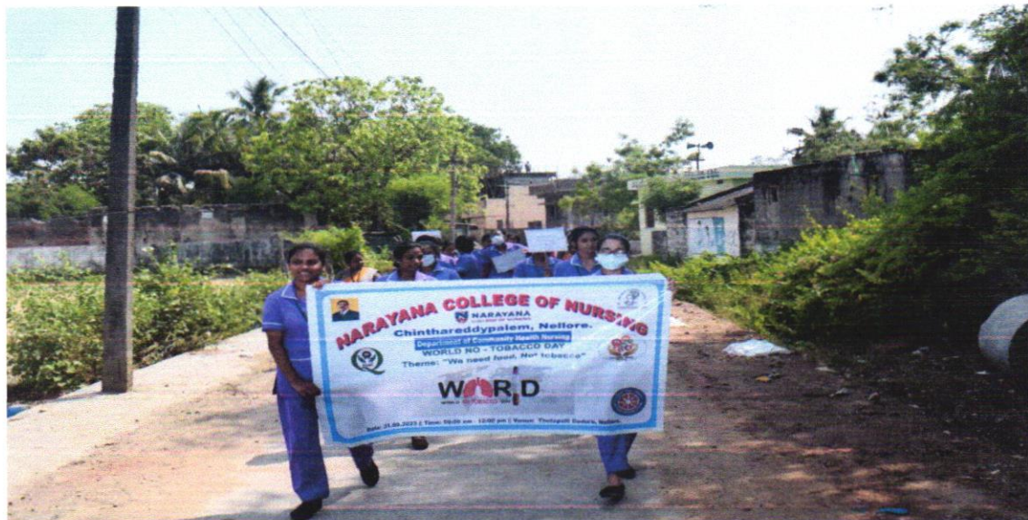
Rally conducted from harijanawada to health center