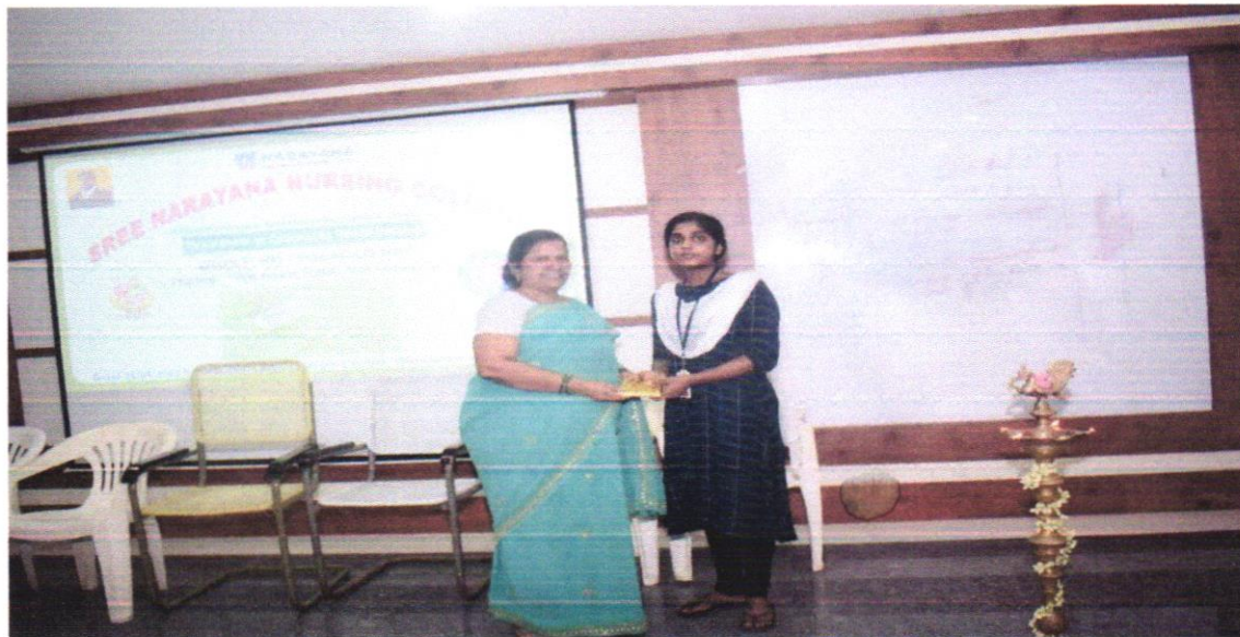
Poster presentation winner